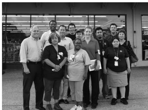
3 rd PLACE Cherry Creek (5734 Manchaca Rd.)