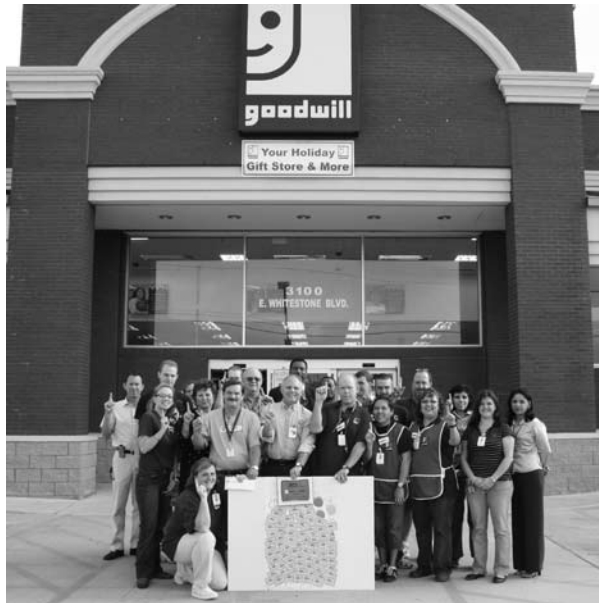
Internally, Goodwill had a contest for raising funds. Cedar Park (3100 Whitestone Blvd.) was 1 st PLACE in the SPY Bucks campaign.

For more information about Goodwill's Youth Services Programs, please contact the Goodwill Community Center at 512.637.7100 or visit the website at www.austingoodwill.org .