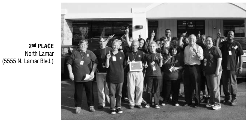
2 nd PLACE North Lamar (5555 N. Lamar Blvd.)